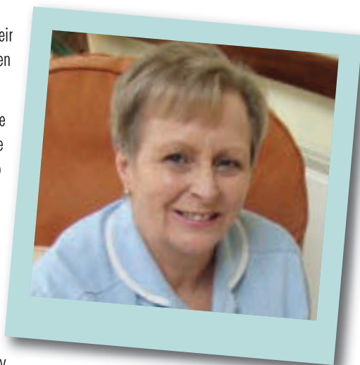
Members of our Hospice at Home team are now caring for patients in Mid Wales

"The overwhelming majority of our patients are now looked after in the community, which is a result of the way we have adapted our services to deliver care locally where it is needed the most.